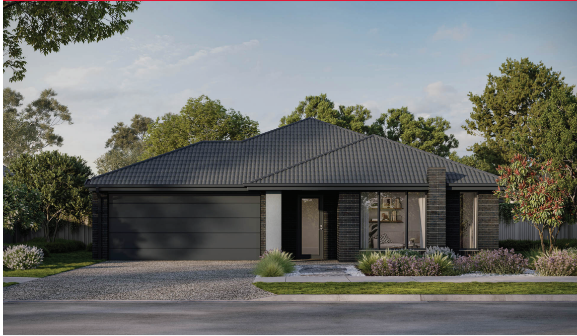
ROSELLA 31 | ELEVATE RANGE