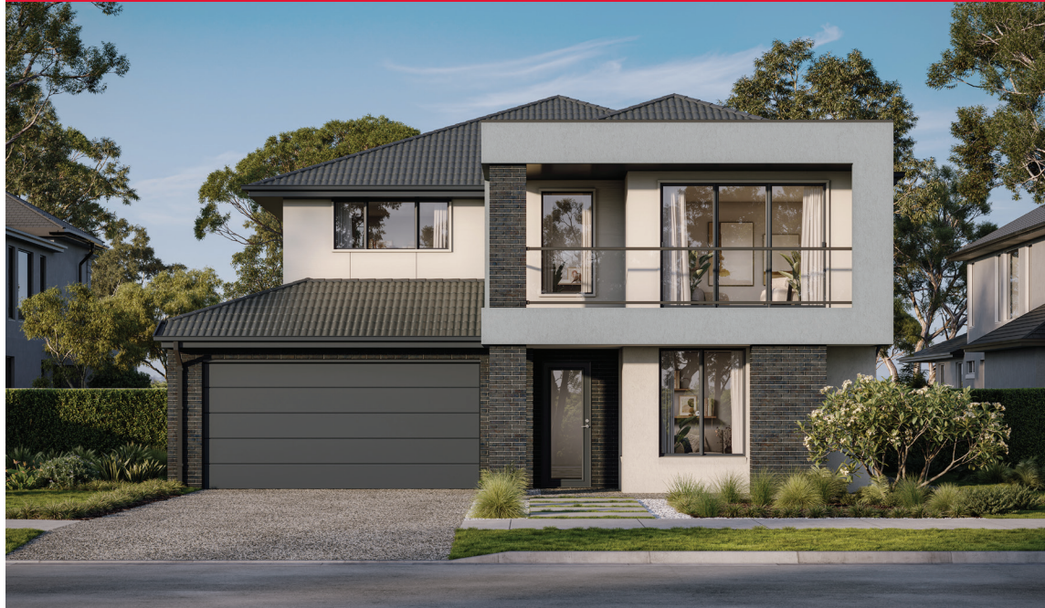
TALLOWOOD 52 | ELITE RANGE